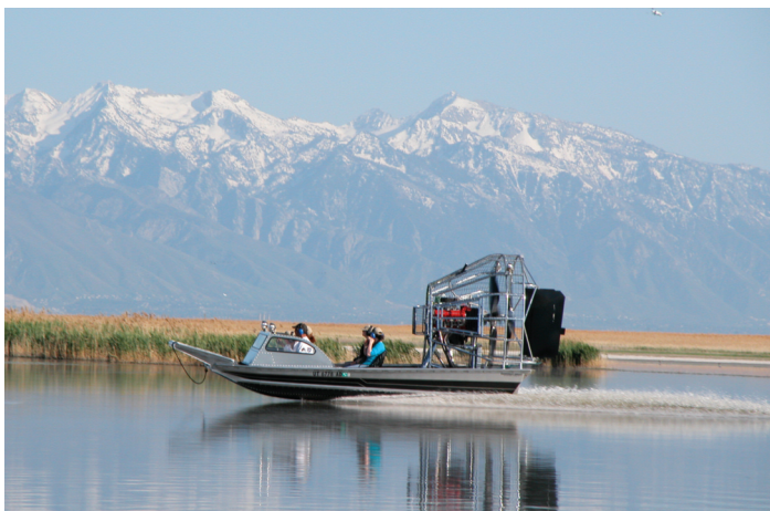
Great Salt Lake adds $1.3 billion annually to Utah's economy, with hunting and other recreational uses (bird watching, wildlife viewing, sailing, camping, bike riding, photography) being important components.